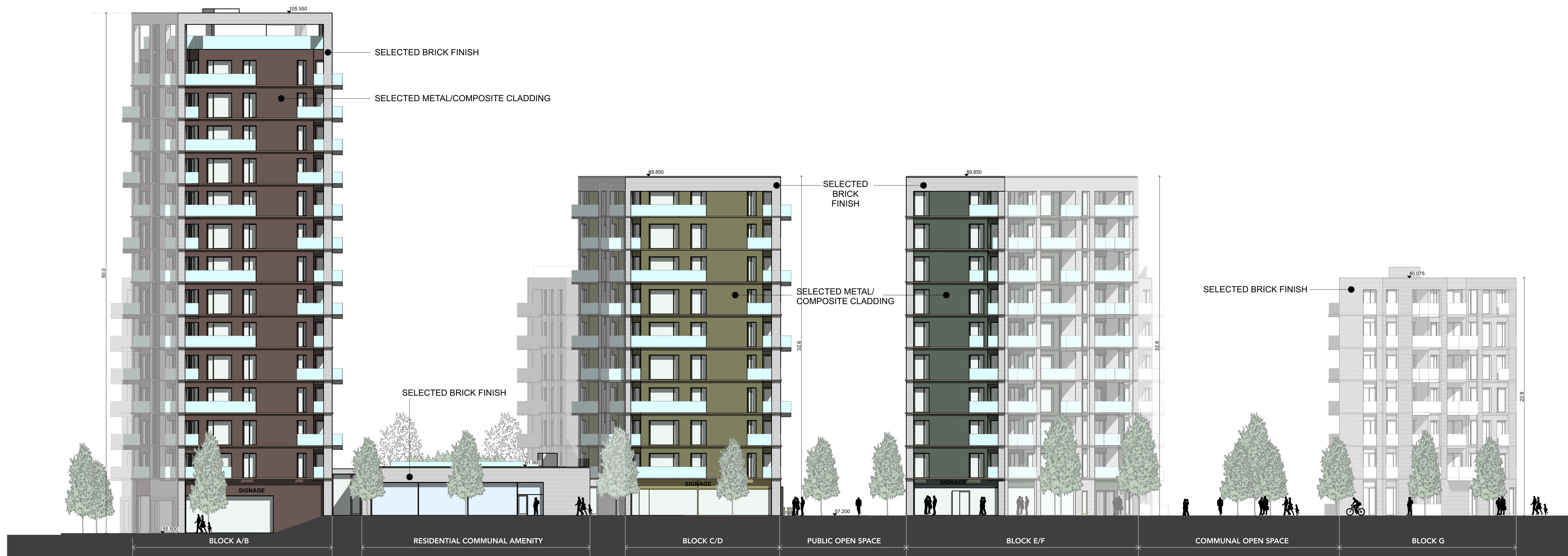
North Elevation SCALE : 1:200

NOTES WALL FINISHES TO BE BRICK/METAL/COMPOSITE CLADDING AS INDICATED. ROOFS TO BE GREEN ROOF TYPE. BALCONIES TO BE GLAZED.